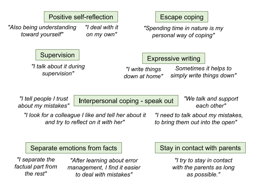
Fig. 2. Emotion-focused coping strategies. Personal strategies to cope with their feelings and emotions related to critical incidences or errors are given as original quotations from the interviewed midwives and loosely grouped according to their content.